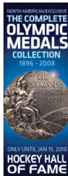
Exhibit runs until January 15, 2010. To view the complete Olympic medal collection from 1896 - 2008 is a once in a lifetime chance.

Graciously, the Olympic Museum consented to the loan, marking the first time a complete collection of medals will ever appear outside of Europe.